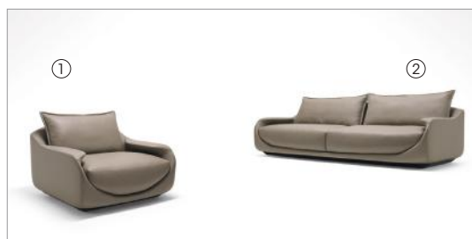
1 Martini 69880 leather 9162

Divano a due posti rivestimento tessuto o pelle Two-seat sofa fabric or leather upholstery cm 247 x 94 x h 76 in 97 1/4 x 37 x h 29 7/8